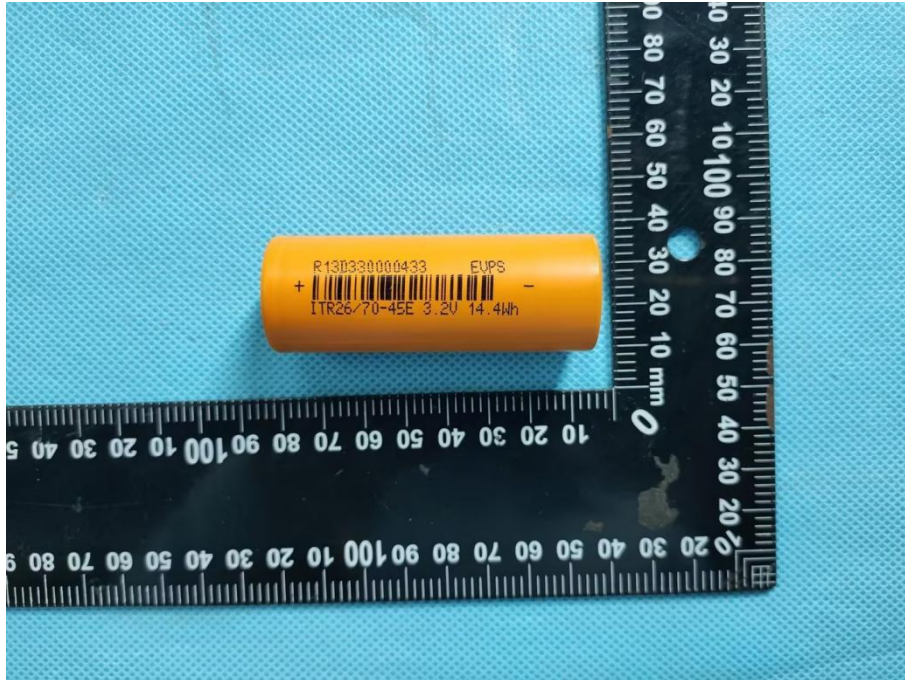
Photo 3 电池正面 Front view of Cell