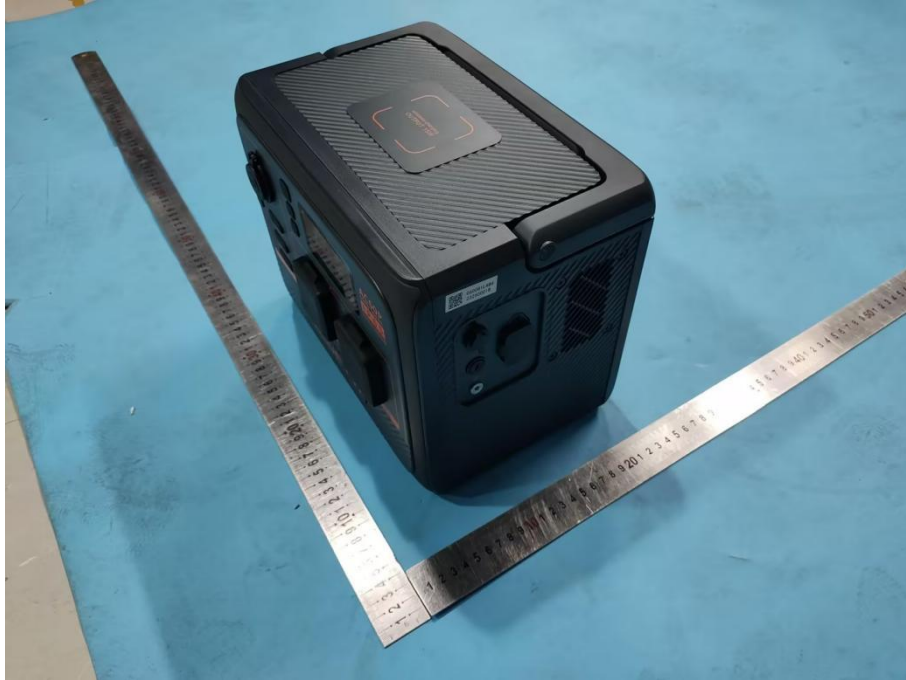
Photo 1 电池组正面 Front view of battery