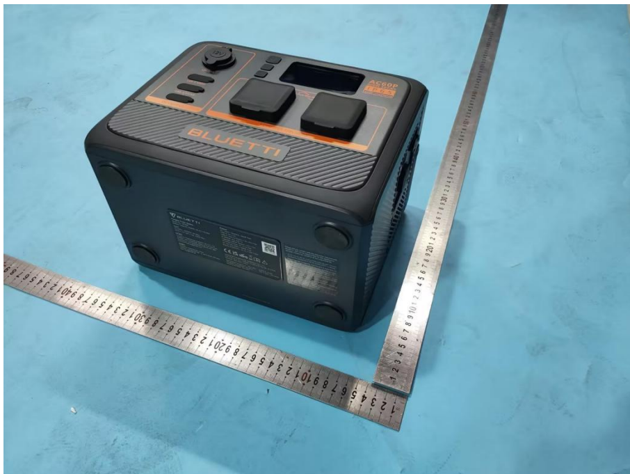
Photo 2 电池组背面 Back view of battery