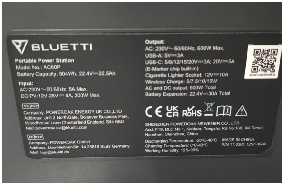
标签特写 Label close-up