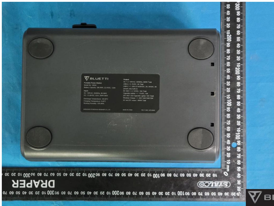
Photo 2 电池组背面 Back view of battery

BLUETTI Portable Power Station Model No.: EB3A Battery Capacity: 268.8Wh, 22.4VDC, 12Ah