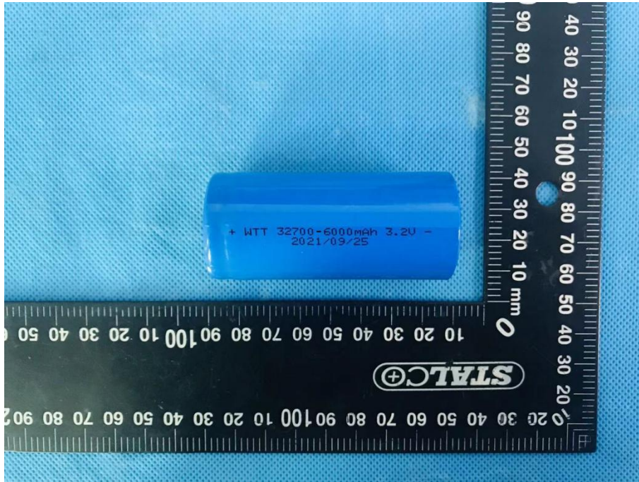
Photo 3 电池正面 Front view of Cell