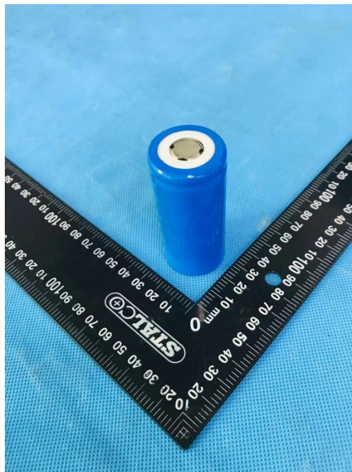
Photo 4 电池背面 Back view of Cell