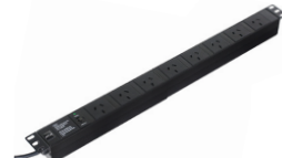
8-Way Horizontal Power Rail DPU-EHA-1U-080210-06-CSI