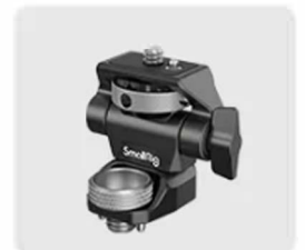
Monitor Mount 2903B