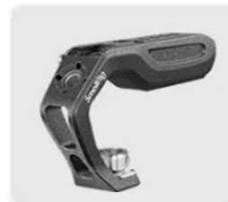
Top Handle 3786