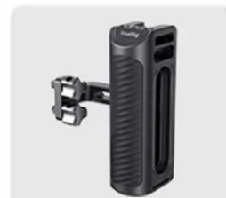
Side Handle HSS2425